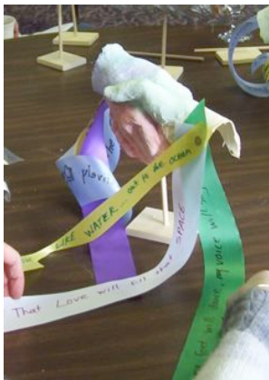
Finding common ground with fun

"The project was easy enough to achieve, but still maintained a realistic learning curve." ... "They really enjoyed it, especially the "helping other adults" part." ... "This project was a great one to get people to interact and communicate." ... "The students I have aren't good direction takers; but they did this effectively." ... "You can be the teacher and the learner."