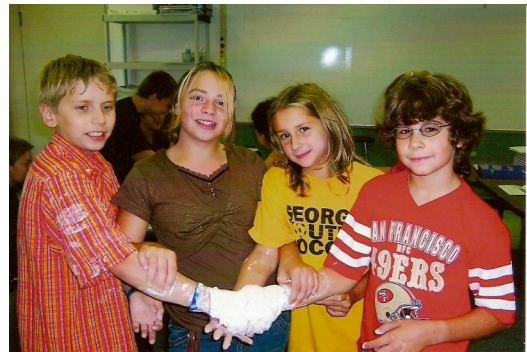
Students “Reach Out” to one another at Georgia Middle School

The Handshake Project™ proved to be a successful kick-off to the year. As reported in the Georgia Middle School August 23 letter to parents and guardians, students learned “that the handshake is a symbol of tolerance and acceptance and is an act of cooperation”.