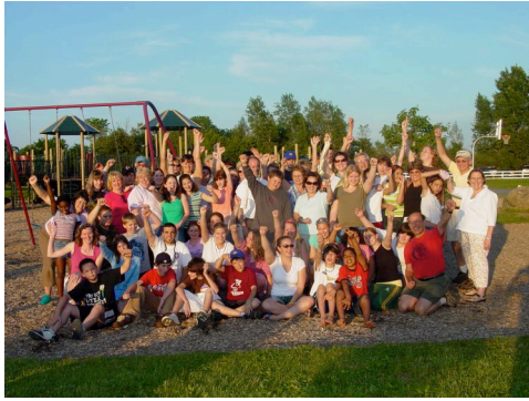
All the hands of Connecting Youth Mentoring