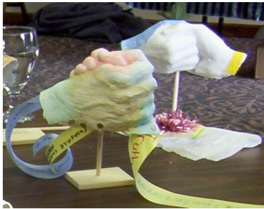
Building respect, one handshake at a time